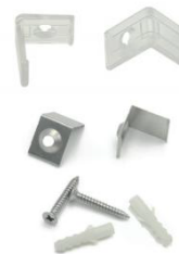
LG1818A-MC Mount Clip